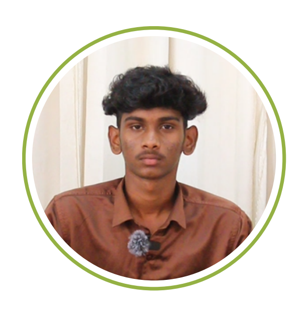
CEO Founder Proprietor of Oneclickz —since 2025